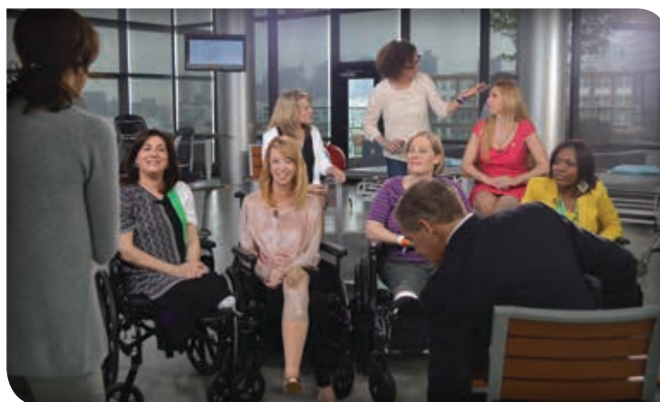
Boston Marathon bombing patients preparing to interview with NBC / Brian Williams.

The SRH CRU team continues to deliver high quality medical and rehabilitation care under a national spotlight. This has