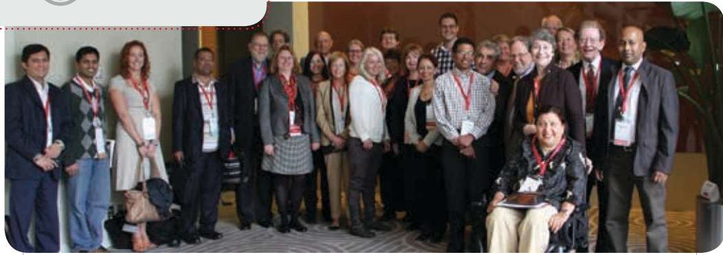
ING members gathered at the ACRM 90th Annual Conference in Orlando, 2013